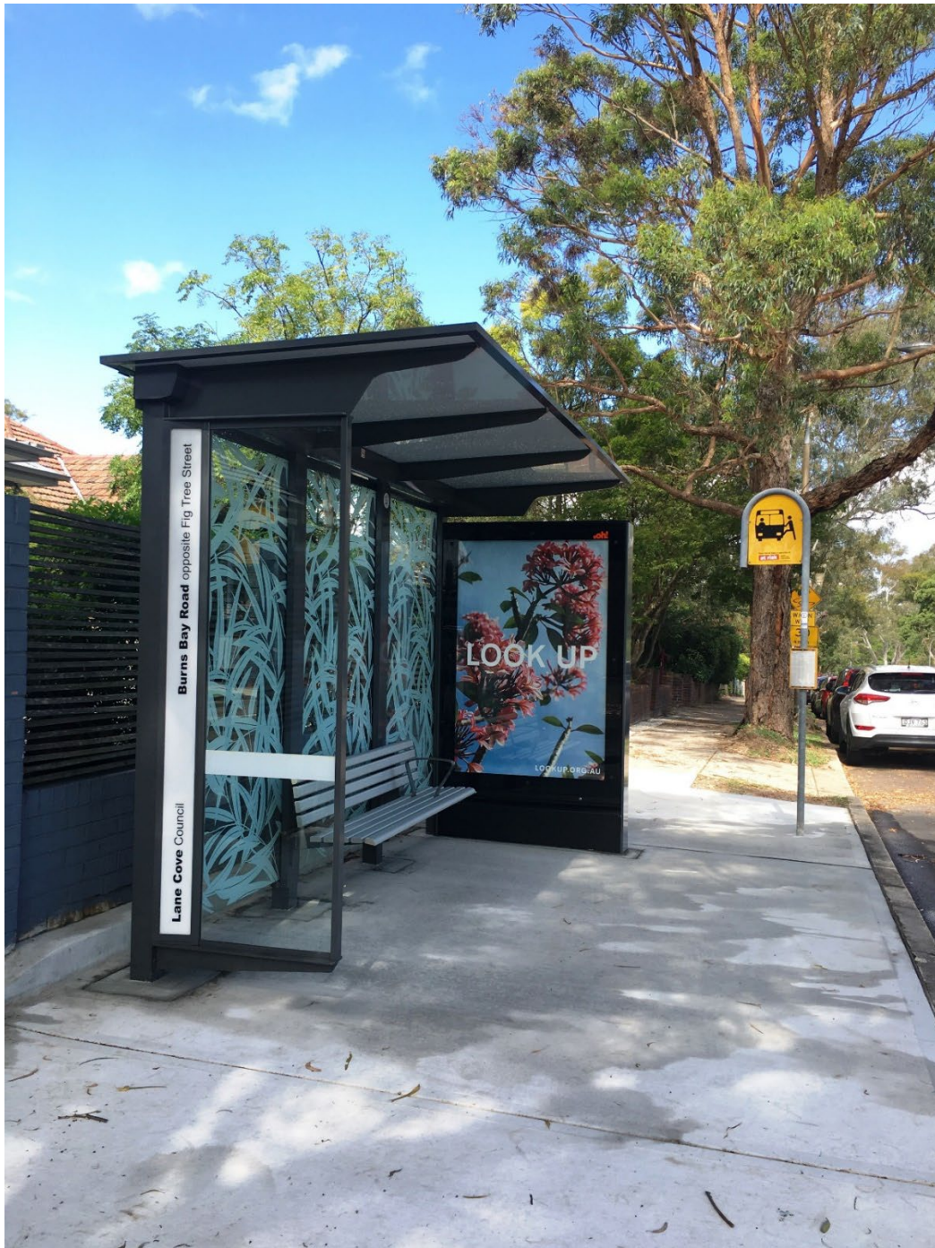
Figure 1 - Example of a bus shelter with advertising in Lane Cove