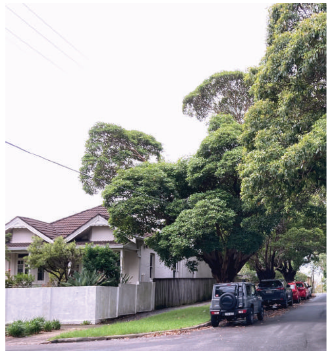
Corner of Riddell Street, Bellevue Hill

These include, but are not limited to, updated definitions, references to new biosecurity legislation and a simplified rear setback control of 25% of total lot depth.