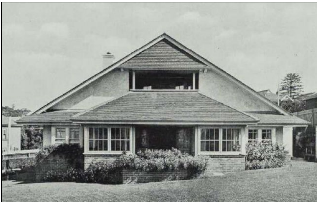
Figure 4: 364 Edgecliff Road, Woollahra – northern façade.