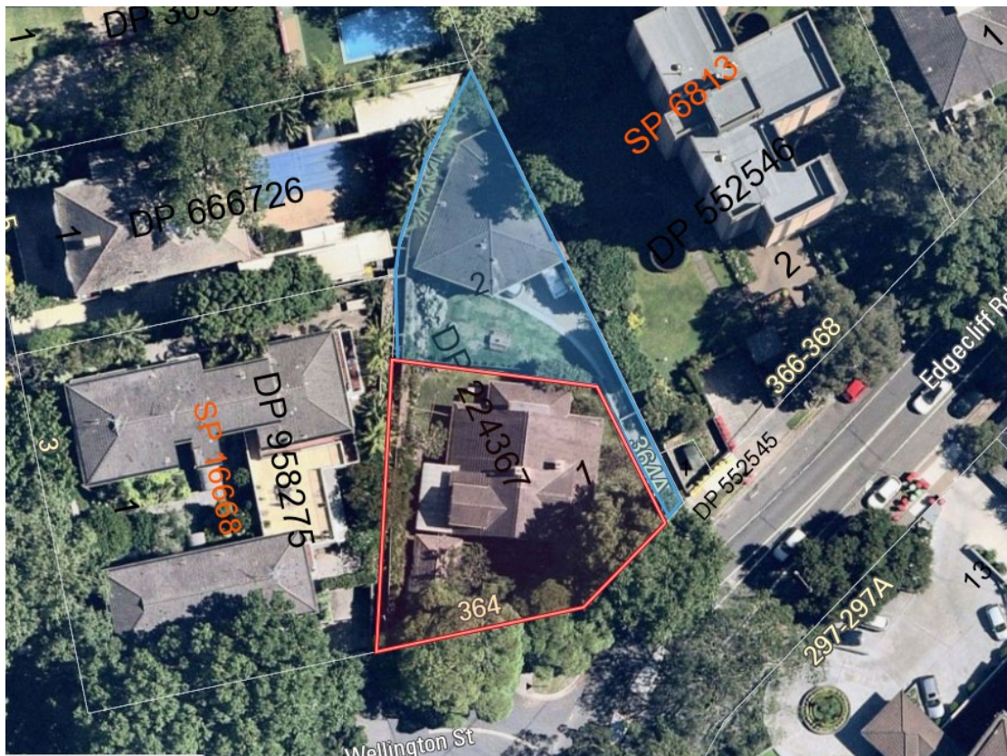
Figure 2: Current aerial photo, with 364 Edgecliff Road, Woollahra highlighted in red and 364A Edgecliff Road, Woollahra highlighted in blue.