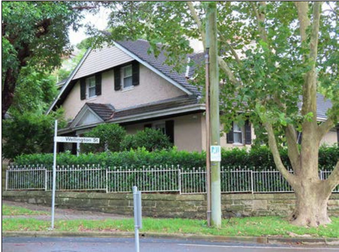
Figure 3: 364 Edgecliff Road, Woollahra viewed from south-east in March 2022.