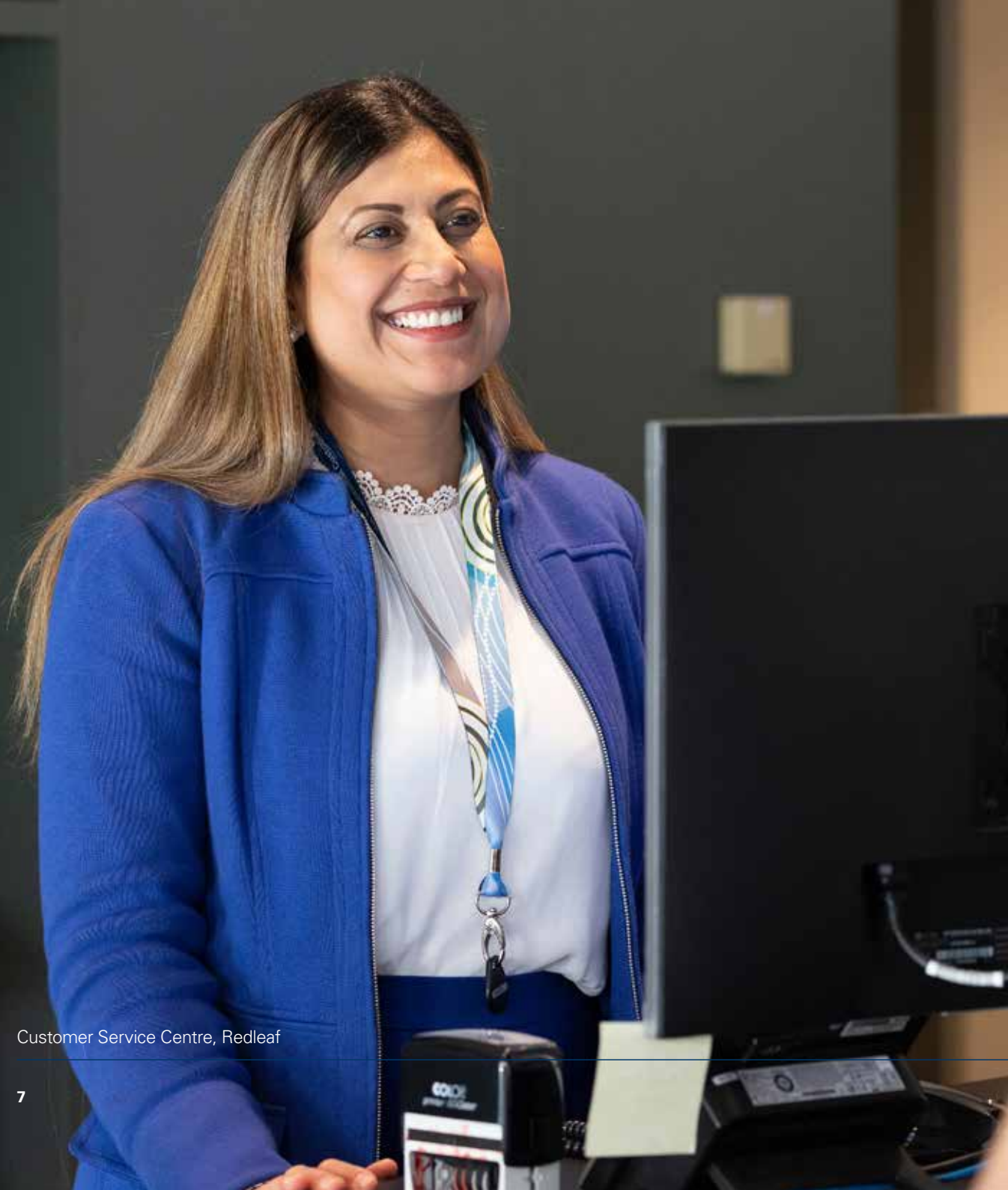
Customer Service Centre, Redleaf