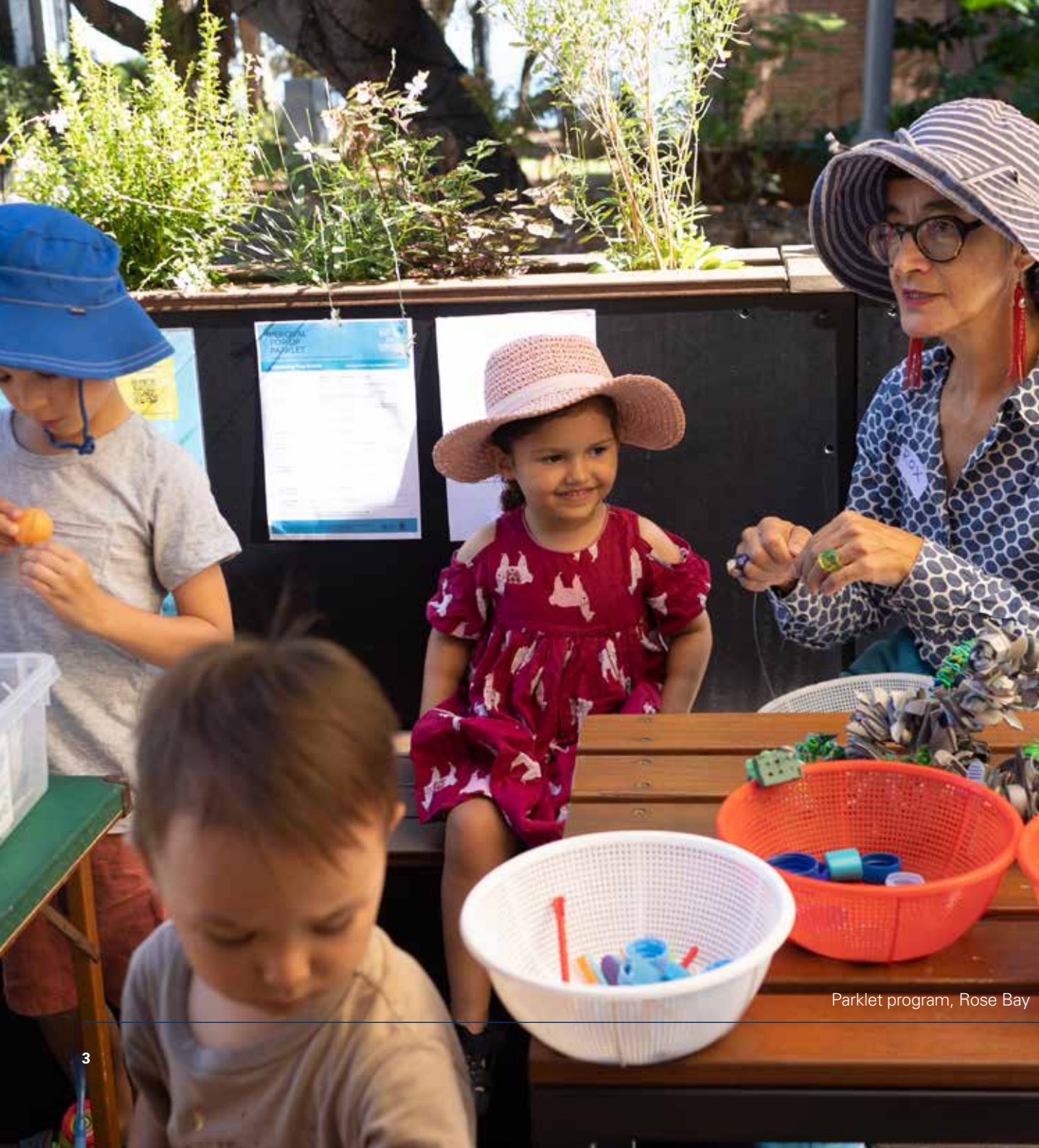
Parklet program, Rose Bay