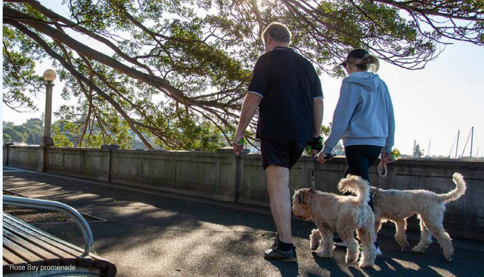
Rose Bay promenade

Our customers are those who live, work, visit, invest in and have a business in the Woollahra Local Government Area (LGA). This includes residents, property owners, license and permit holders, business owners, students, volunteers, community groups, and many more.