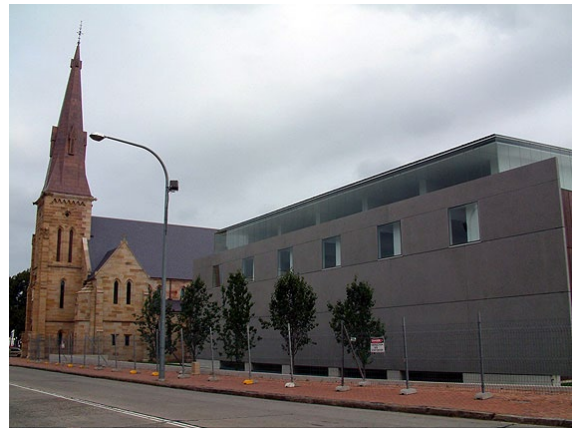
Figure 8. St Patricks cathedral viewed from Victoria Road looking east. Despite the new extension building being larger and clearly modern, it is recessive in design to the original cathedral.