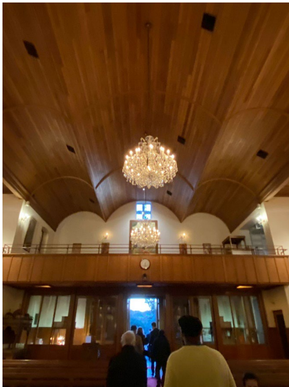
Figure 5. St George interiors – rear mezzanine.