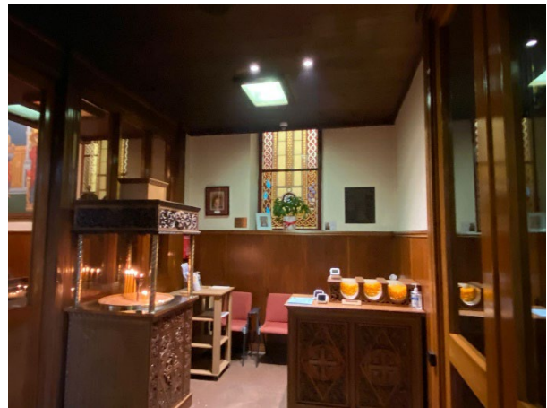
Figure 2. St George interiors – entry vestibule.