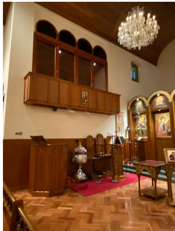
Figure 4. St George interiors – side mezzanine balcony.