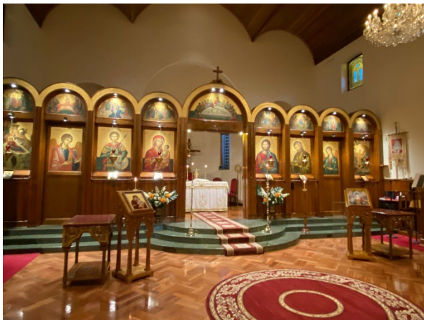
Figure 1. St George interiors – iconoclasts.

The modifications made to the Church building have responded to the changing needs of the congregation, and have included necessary maintenance. With that in mind, the interiors of the church have had a number of alterations and modifications. However, staff noted that these alterations were sympathetic in nature and did not appear to have obscured original elements of the building.