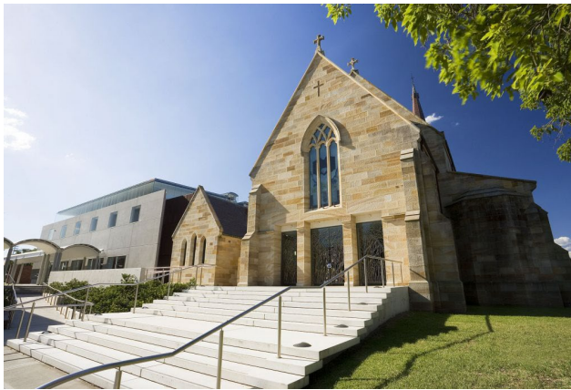
Figure 7. St Patricks Cathedral, Parramatta. The new church extension is positioned to the west (left) of the original sandstone church, and connected with an enclosed breezeway.