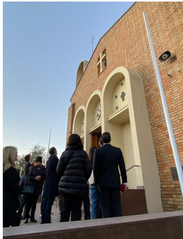
Figure 6. St George – front of church.