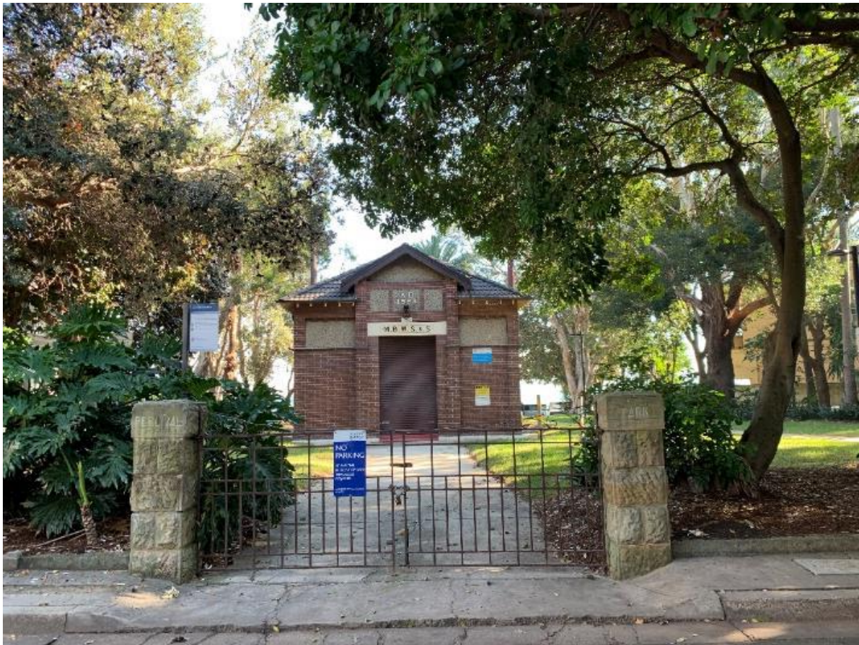
Figure 1: Sewage pumping station (SPS 46) and sandstone gate posts and metal gates viewed from Collins Avenue looking north-west

The subject site is not listed on the NSW State Heritage Register (SHR), nor is it identified as a local heritage item or located in a Heritage Conservation Area in Schedule 5 of Woollahra Local Environmental Plan 2014 (Woollahra LEP 2014). The site is not in the vicinity of a listed heritage item.