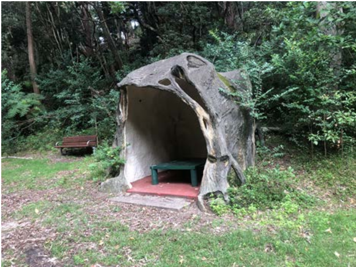
Figure 5: One of the artificial rock shelters constructed by H Arnold at Cooper Park during the 1930s and located near the picnic area in the centre of Cooper Park (Photo: Chris Betteridge, 29 March 2019)