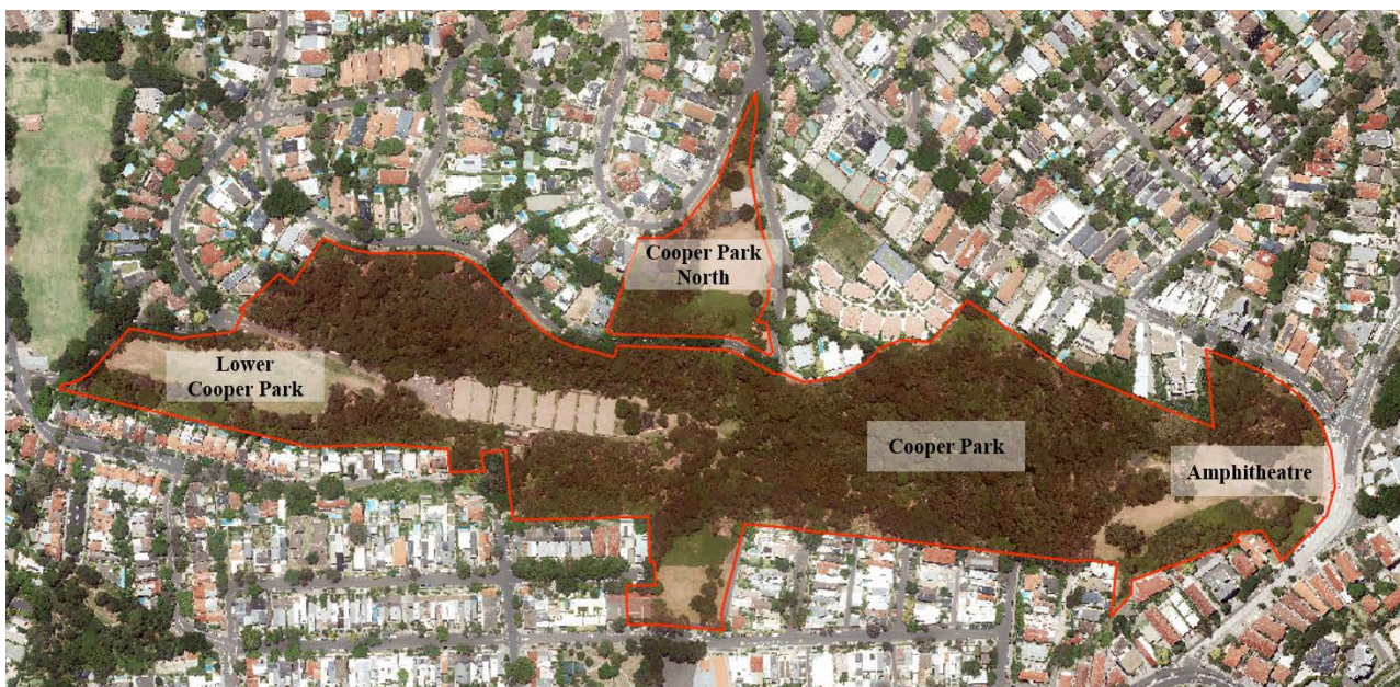
Figure 1: Aerial photograph with the boundary of Cooper Park outlined in red.

The eastern end of Cooper Park is characterised by an open grassed area with expansive views (the amphitheatre, see Figure 2 ). A smaller open grassed area to the south of the main area of the park is known as Fig Tree Lane Reserve and located over Fletcher's Gully.