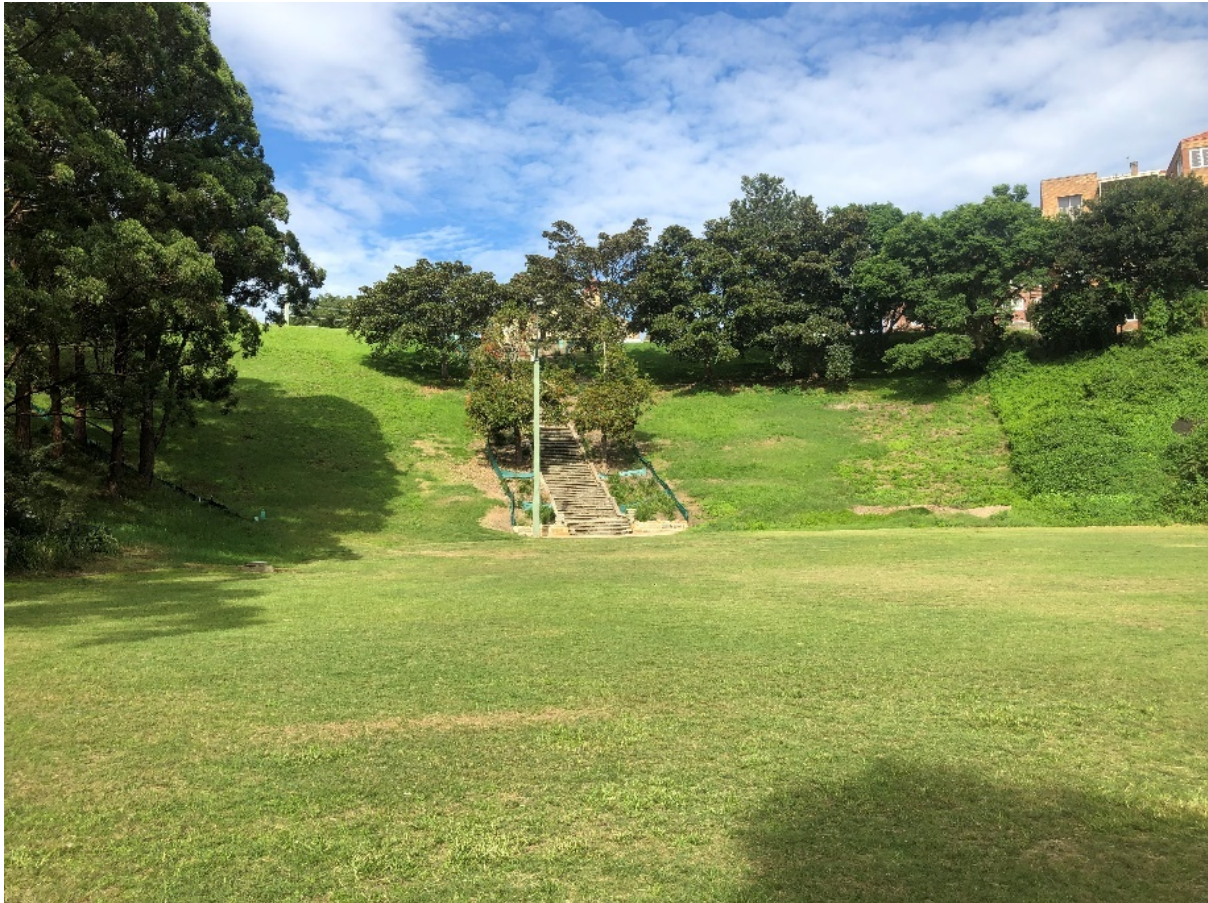
Figure 2: The Amphitheatre, Cooper Park, with stone steps leading down from Victoria Road (Photo: Chris Betteridge, 29 March 2019)