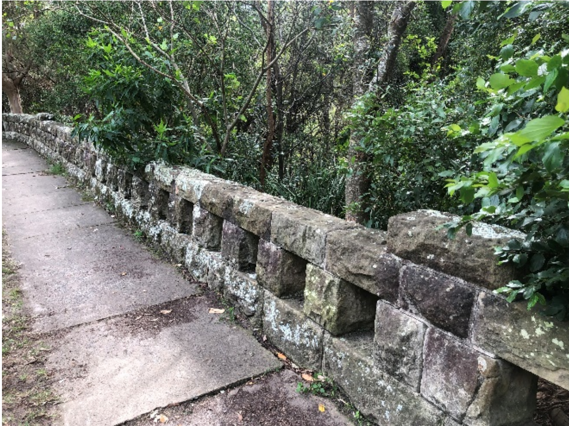
Figure 4: Sandstone balustrade near the Amphitheatre, Cooper Park. (Photo: Chris Betteridge, 29 March 2019)

(Photo: Chris Betteridge, 29 March 2019)