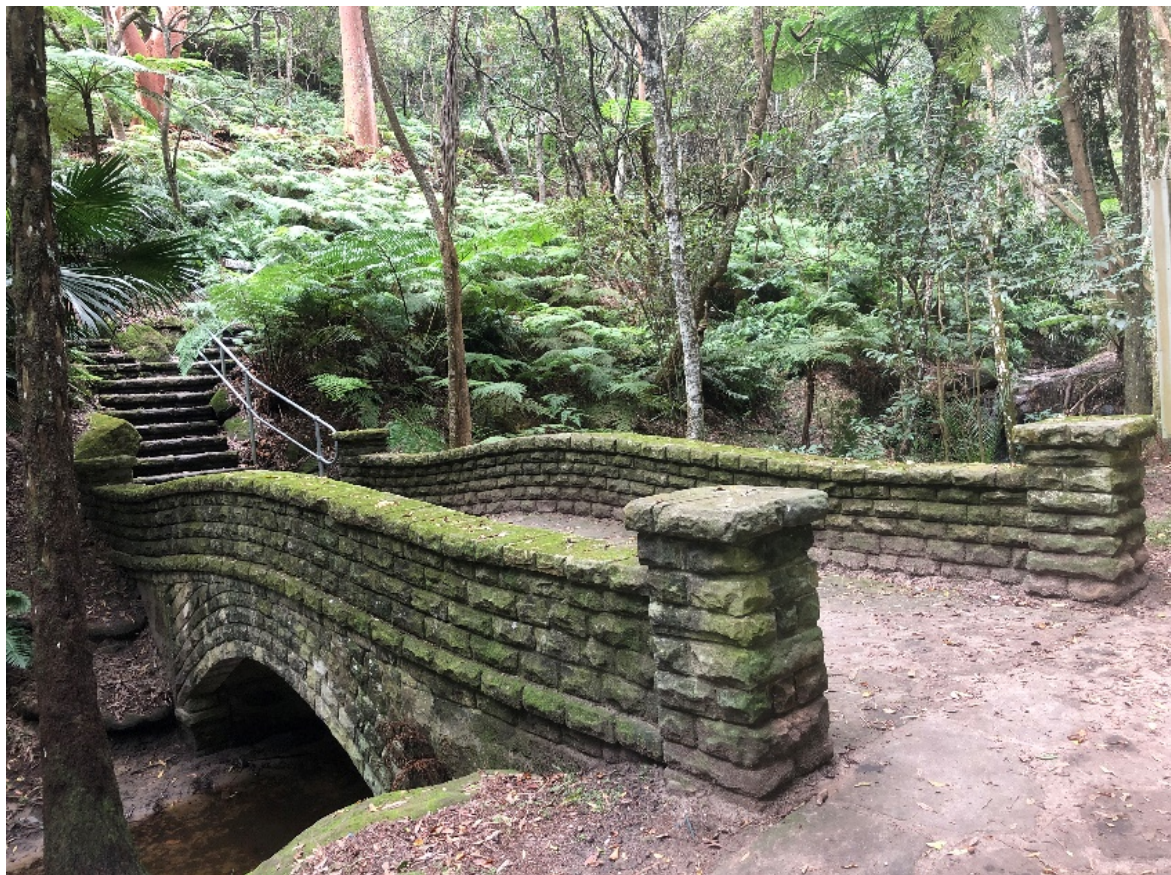
Figure 3: View of Moon Bridge, in the centre of Cooper Park.