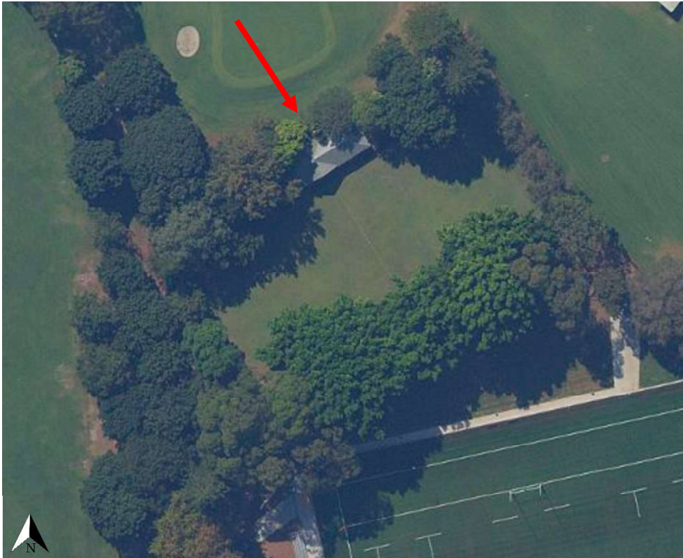
Figure 4: Aerial photograph over the clubhouse and lawns with club house indicated with arrow