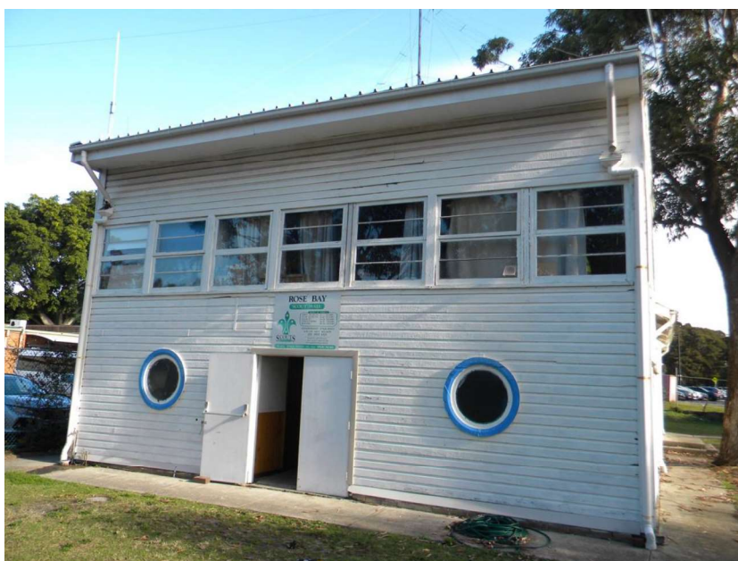
Figure 5: Rose Bay Scout Hall, front (north-eastern) elevation

The subject site is not listed on the NSW State Heritage Register (SHR), nor is it identified as a local heritage item or located in a heritage conservation area in Schedule 5 of Woollahra Local Environmental Plan 2014 (Woollahra LEP 2014).