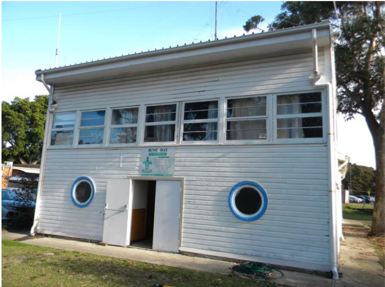
Figure 1: Rose Bay Scout Hall, front (north-eastern) elevation (WP Heritage and Planning)