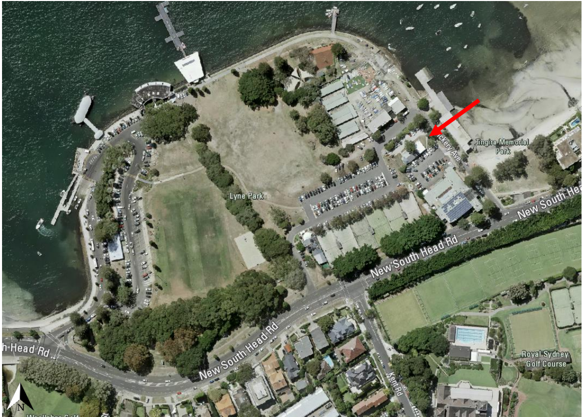
Figure 2: Site location. The arrow points to the site (Woollahra Council GIS)