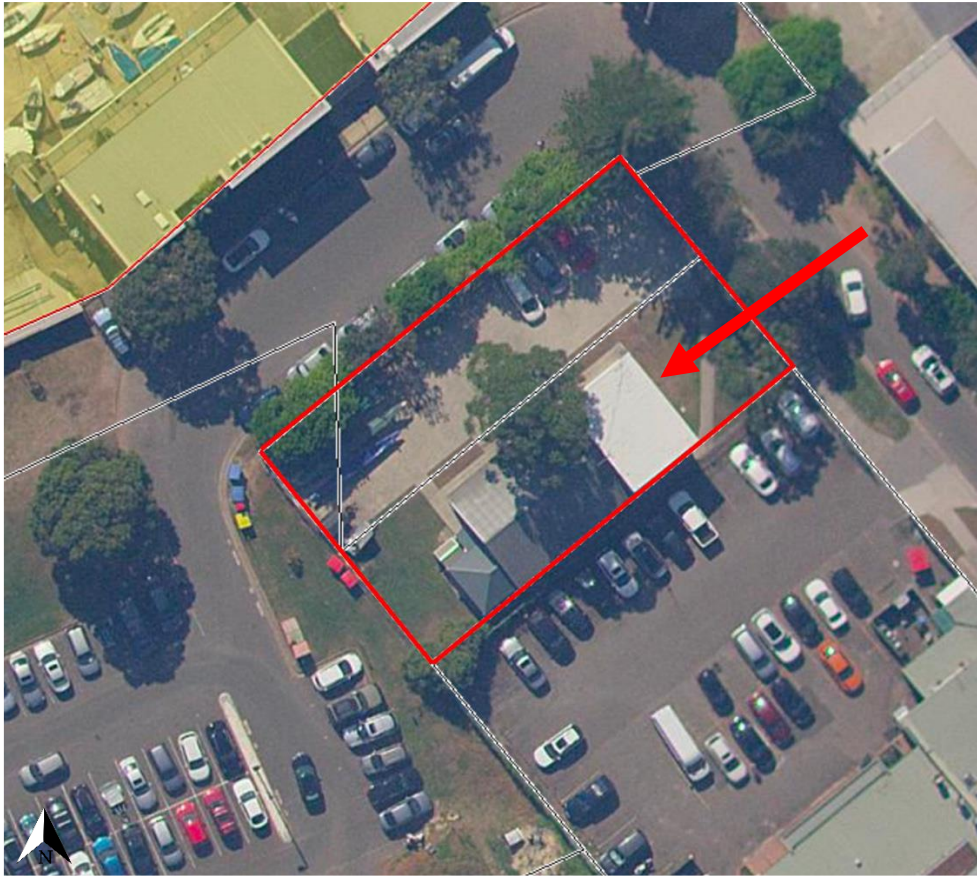
Figure 3: Aerial photograph over the site with Scout Hall indicated by arrow (SIX Maps; annotation by WP Heritage and Planning)