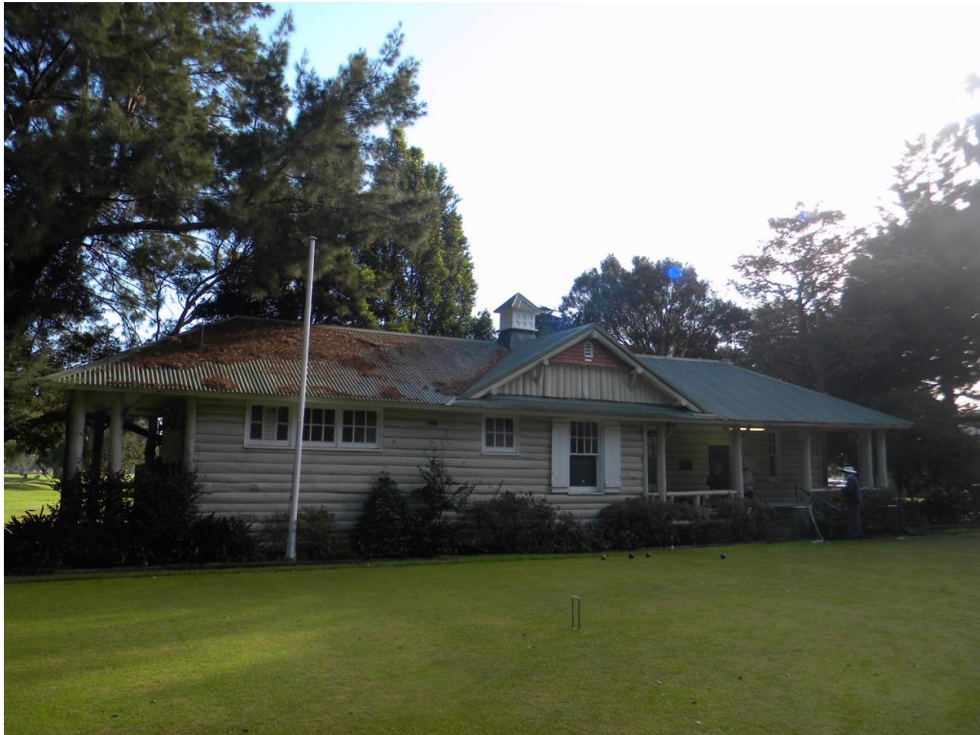
Figure 5: Sydney Croquet Club, southern elevation (WP Heritage and Planning)