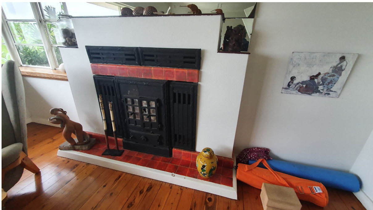
Figure 11: Original fireplace detailing.