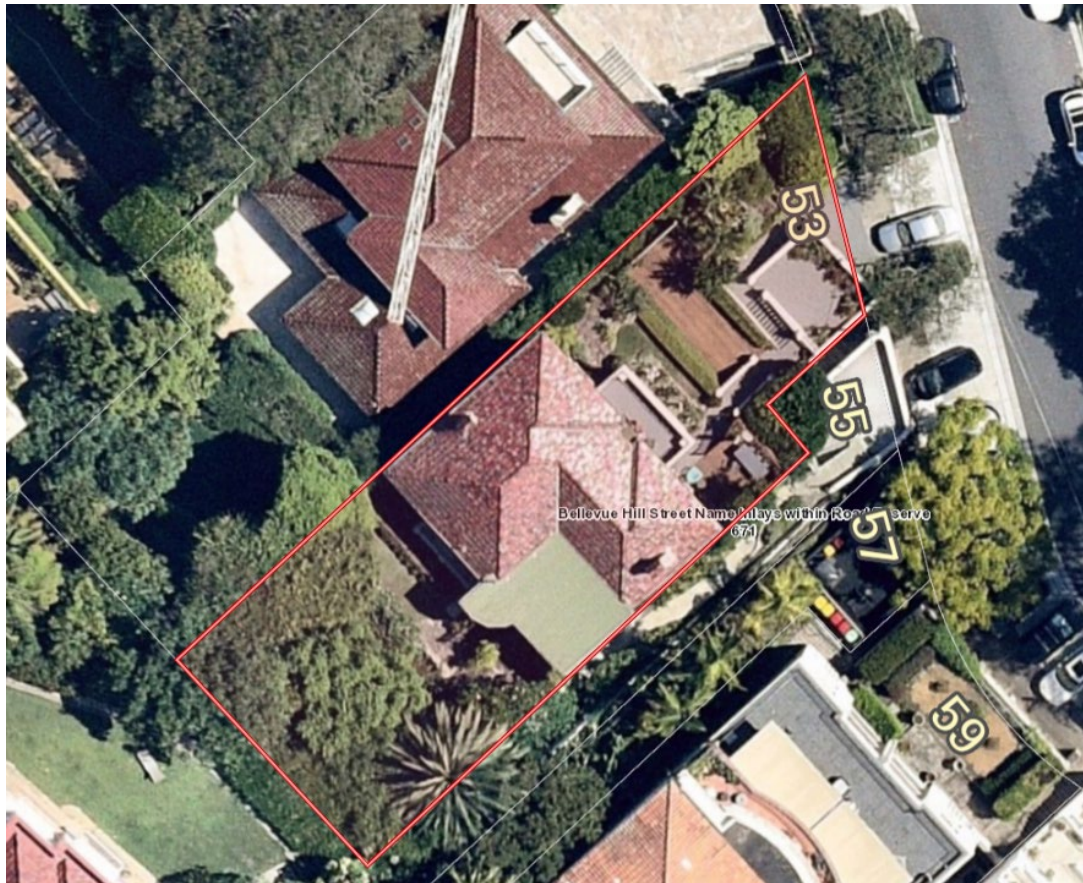
Figure 2: Current aerial photo, February 2022.