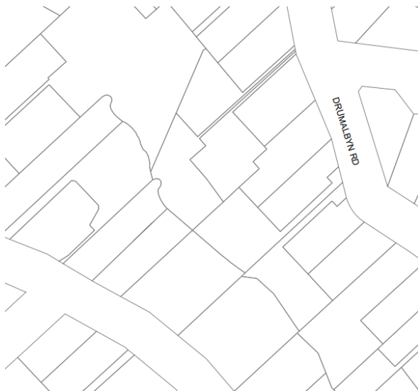
Figure 13: Extract from existing Woollahra LEP 2014 Heritage Map (Sheet HER_003D)