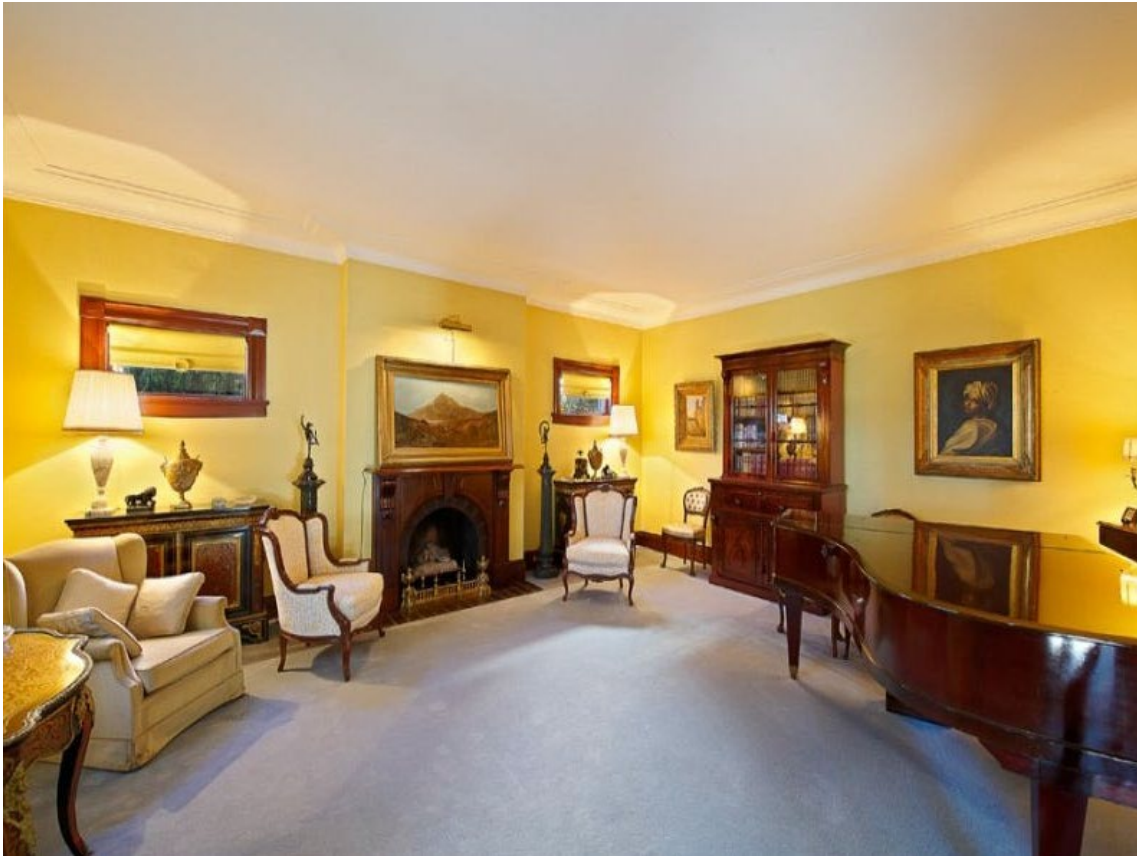
Figure 4: Living room, April 2010.