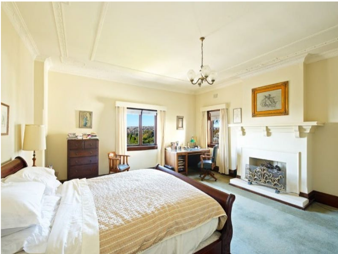
Figure 5: Bedroom, April 2010.