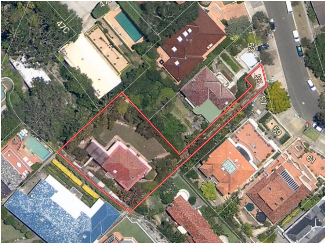
Figure 7: Aerial photo of 55 Drimalbyn Road, Bellevue Hill.