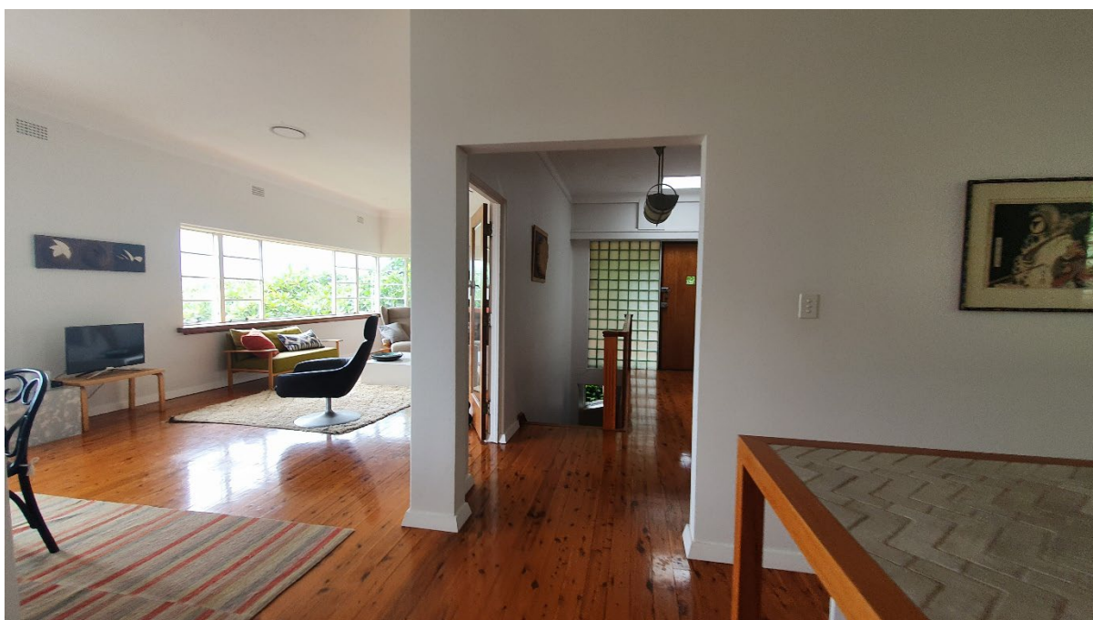
Figure 10: Internal open plan for 55 Drumalbyn Road, Bellevue Hill.