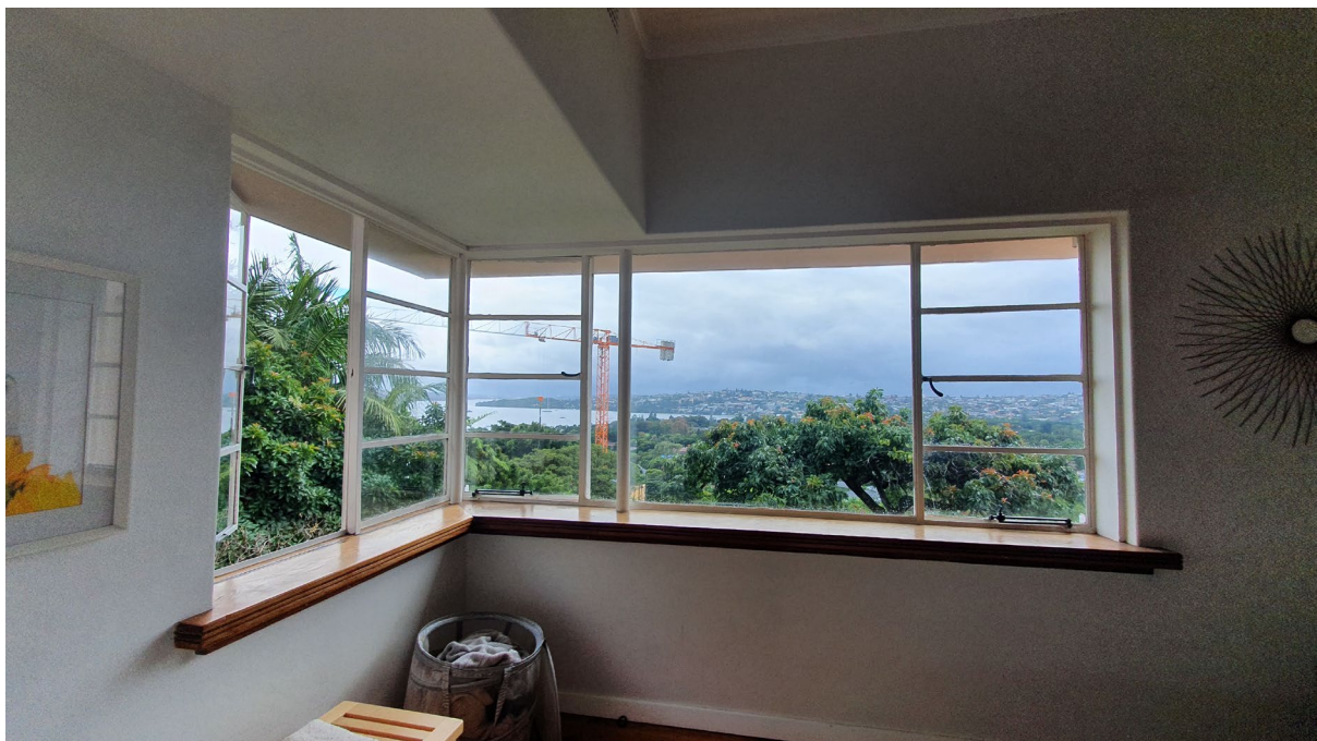
Figure 12: Original horizontal window detailing.