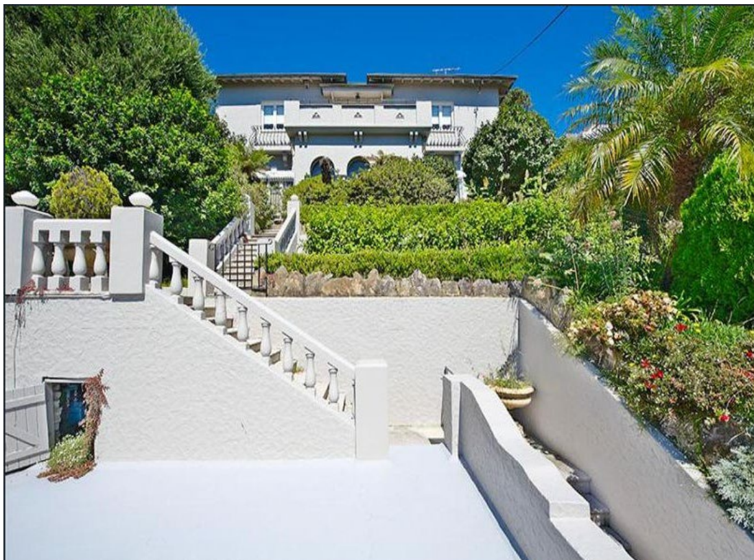
Figure 3: Front elevation, April 2010.