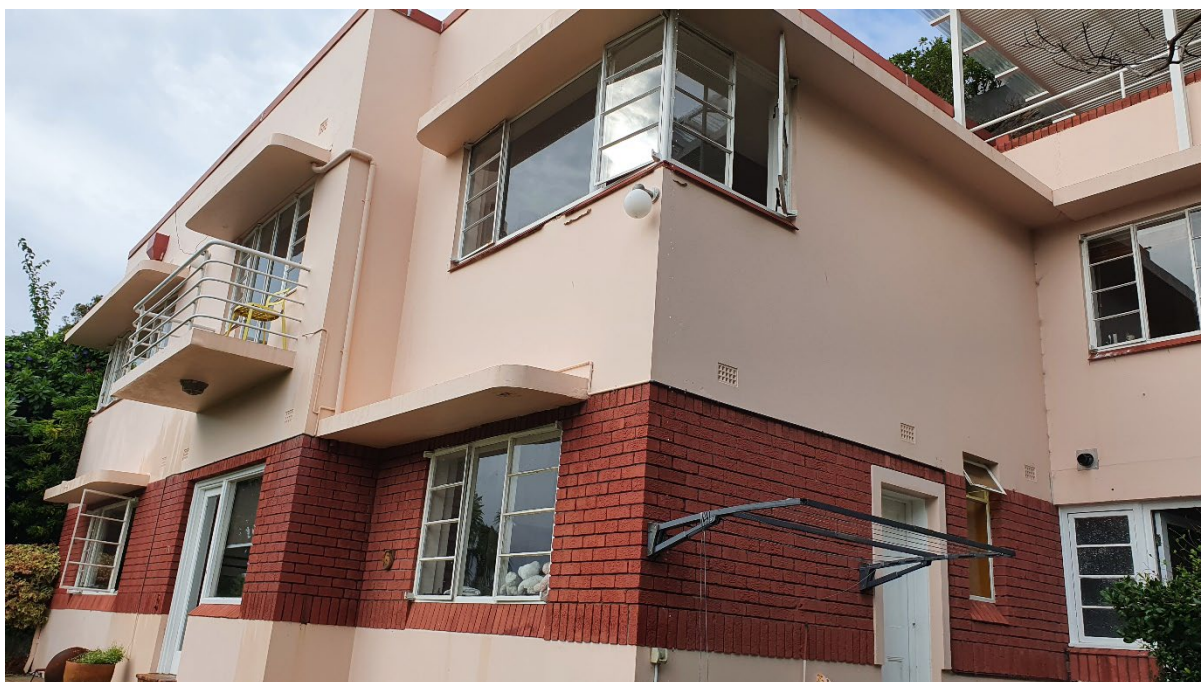
Figure 9: External view of 55 Drumalbyn Road, Bellevue Hill.