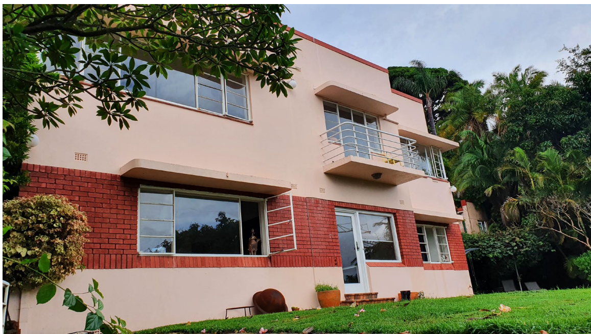
Figure 8: Front elevation of 55 Drimalbyn Road, Bellevue Hill.