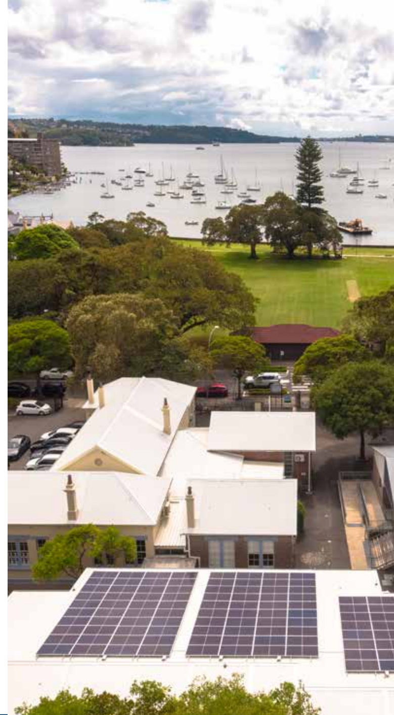
Double Bay Public School rooftop solar