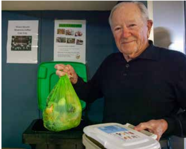
Kitchen to Compost Program