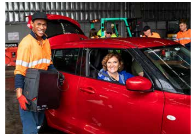
Drop-off service for hard to recycle items