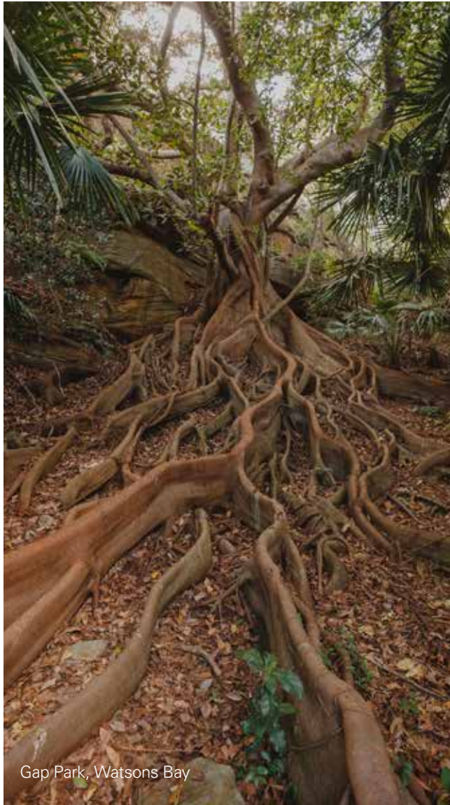
Gap Park, Watsons Bay

Council's vision is to have a thriving, inclusive, sustainable and resilient community that will benefit future generations . The Woollahra Environmental Sustainability Action Plan 2023–2028 supports Council's vision by documenting Council's