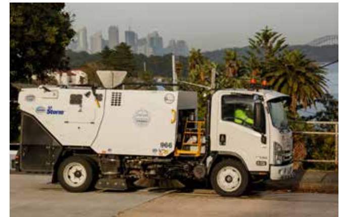
Council street sweeper