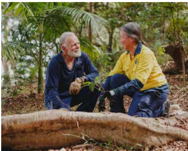
Bushcare volunteering in our parks.