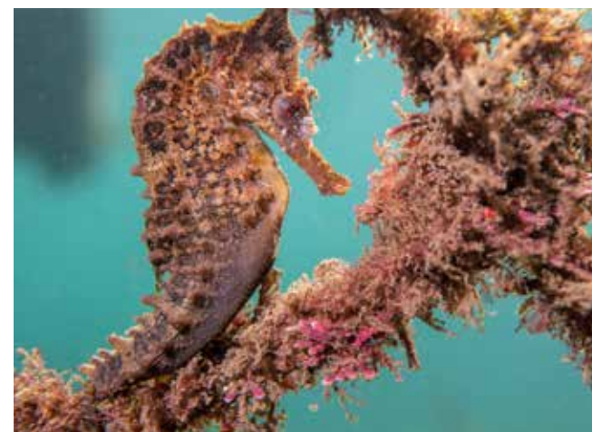
White's Seahorse ( Hippocampus whitei )