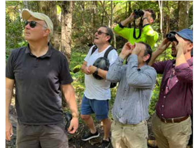
Staff volunteers observing Powerful Owls.