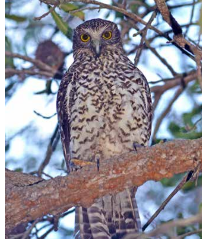
Powerful Owl ( Ninox strenua )

To protect biodiversity in Woollahra, Council developed a Biodiversity Conservation Strategy, actions from which have been implemented since 2015. In recognition of the important role our urban forest plays in reducing urban heat, sequestering carbon, improving air quality and providing habitat, Council has developed an Urban Forest Strategy, which will complement the Biodiversity Conservation Strategy.