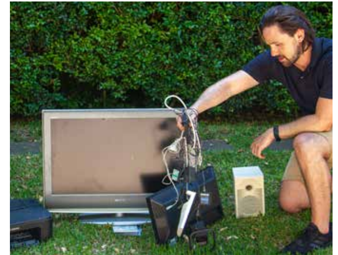
E-waste bookable kerbside collection