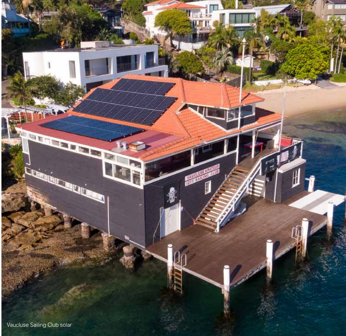
Vacluse Sailing Club solar