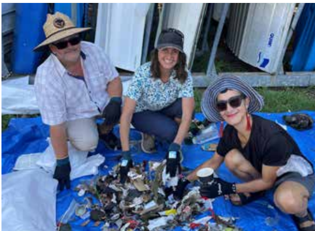
Beach clean-up at Rose Bay.

Woollahra Council plays a critical role in protecting our natural environment by ensuring that our activities do not negatively impact on the environment. We aim to conserve and enhance the important pockets of bushland in our area, and protect our waterways and beaches. Council aims to minimise resource use and support the community to do the same, in order to ensure a sustainable future.