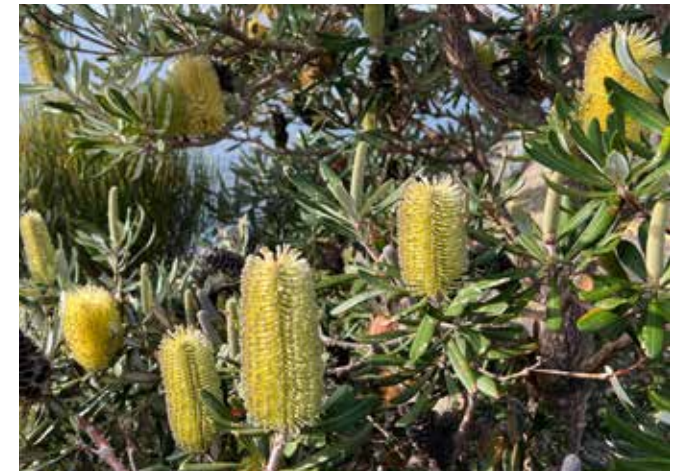
Native flowering plants create habitat for pollinators and birds.