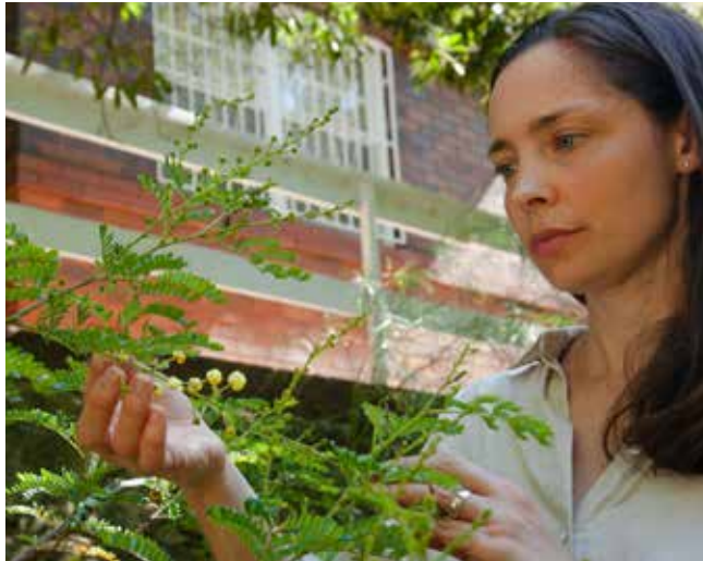
Programs are developed to protect threatened species.