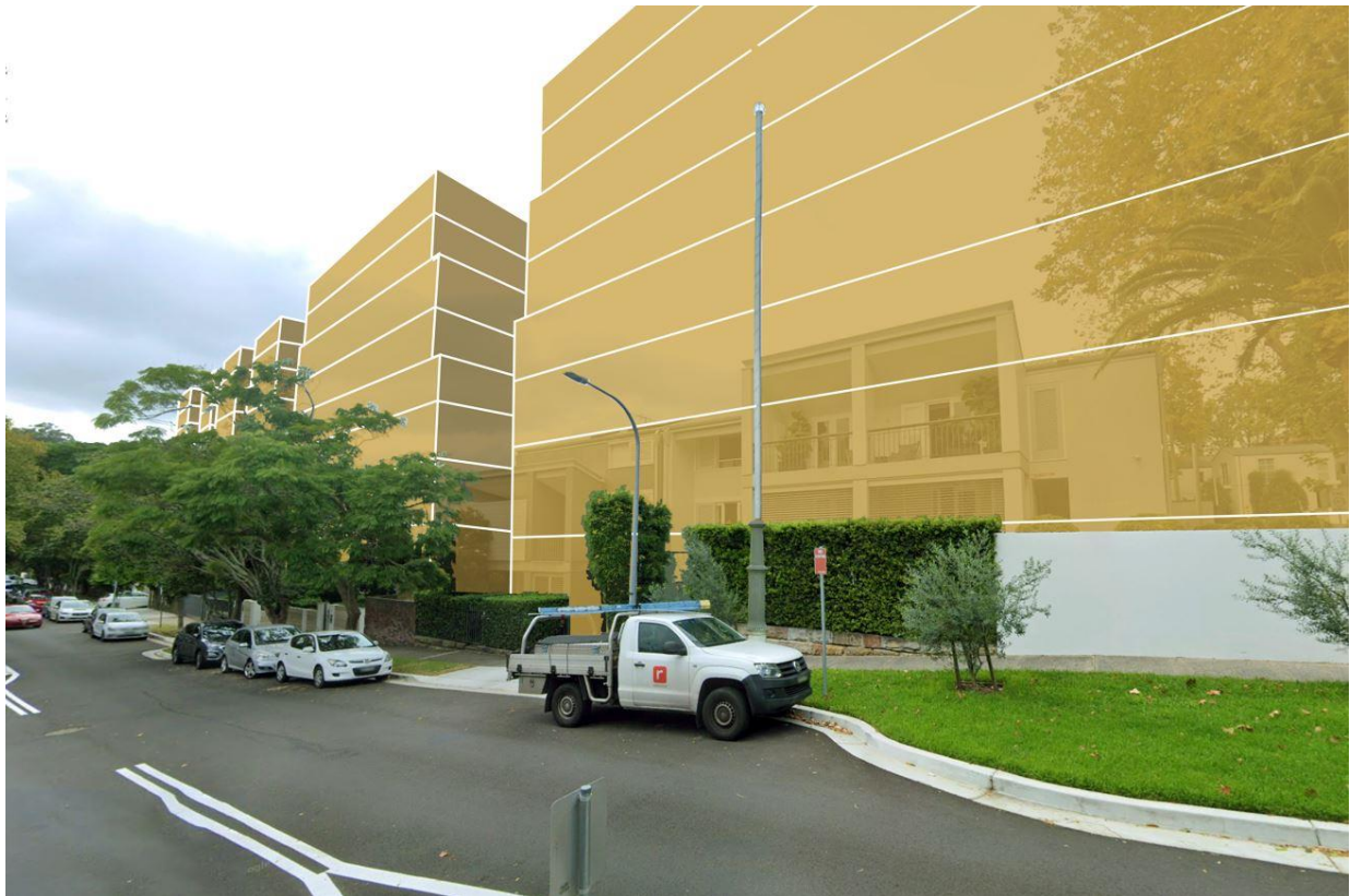
Photomontage of Court Street in Double Bay illustrating the drastic nature of the NSW Government’s proposed planning changes

lowandmidrisehousing@planning.nsw.gov.au and premier@dpc.nsw.gov.au .