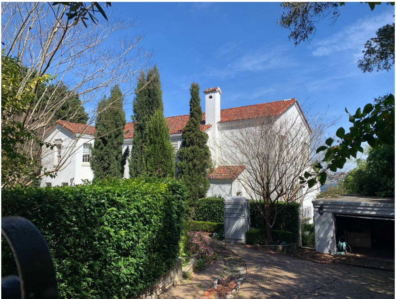
Figure 1: Partial view of the subject dwelling house at 46 Vacluse Road, Vacluse.

The site is the subject of an Interim Heritage Order (IHO) issued by the Minister under Section 24 of the Heritage Act 1977 as published in NSW Government Gazette No. 165 of 6 December 2019, p.5406.