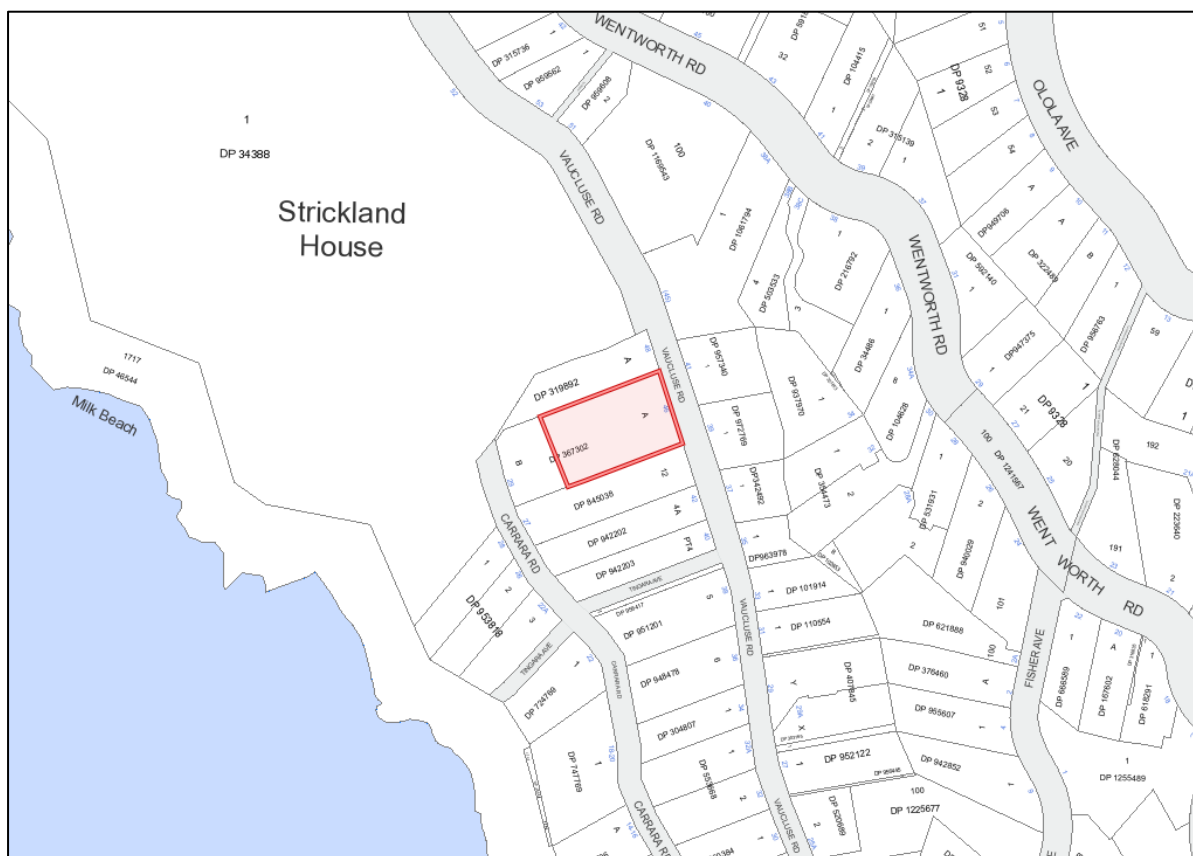
Figure 3: Cadastral map of site