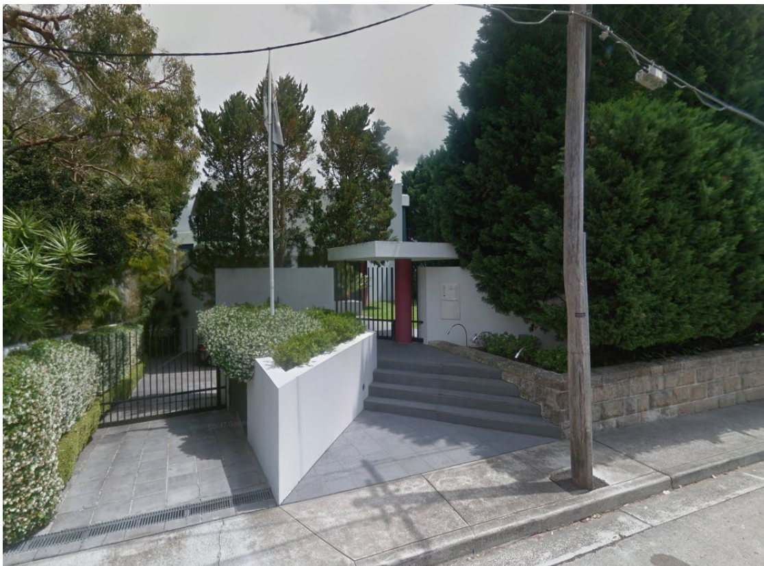
Figure 6: 27 Carrara Road, October 2017.