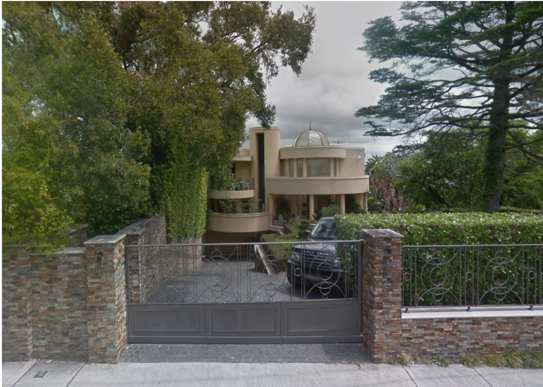
Figure 5: 48 Vaucluse Road, Vaucluse, October 2017.