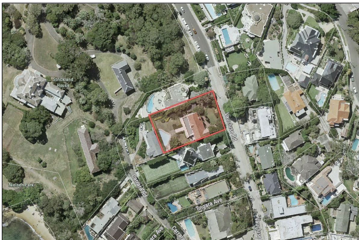
Figure 2: 2018 aerial photograph of site