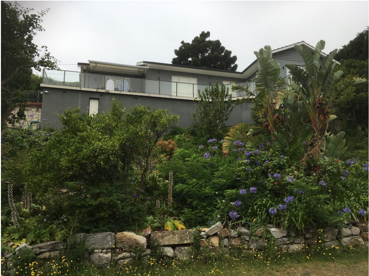
Figure 7: 29 Carrara Road, Vacluse.