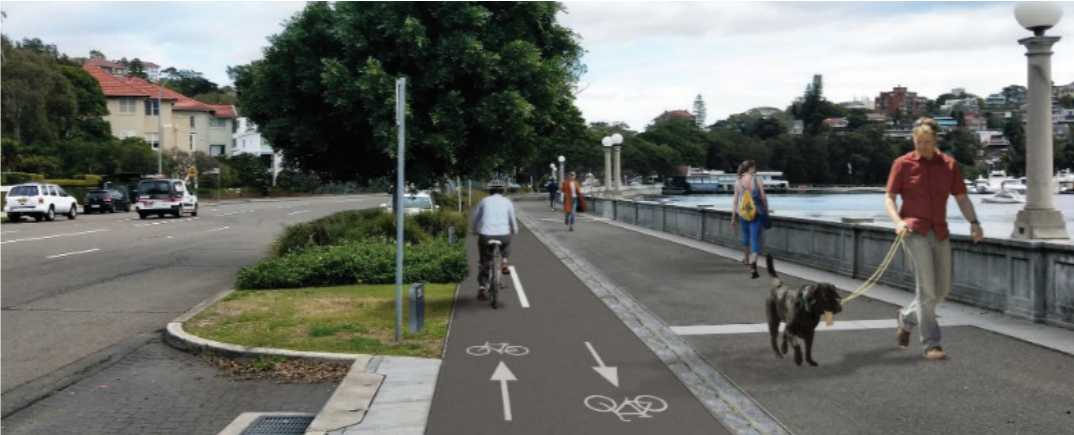
Separated bi-directional cycleway along Rose Bay Promenade.

When complete the cycleway will form part of a critical east-west cycling connection, improving transport options for all and linking several of our open recreational spaces, including Lyne Park and the Rose Bay Promenade.