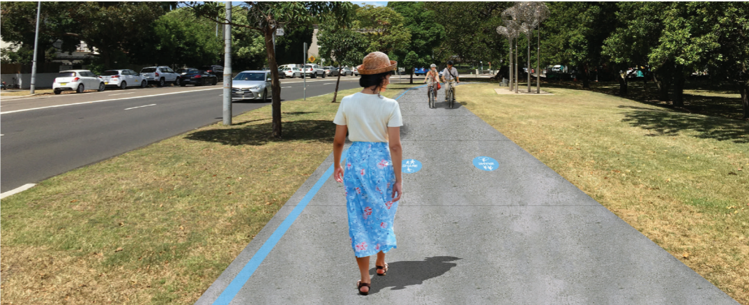
Shared pedestrian and cycle path at Lyne Park.